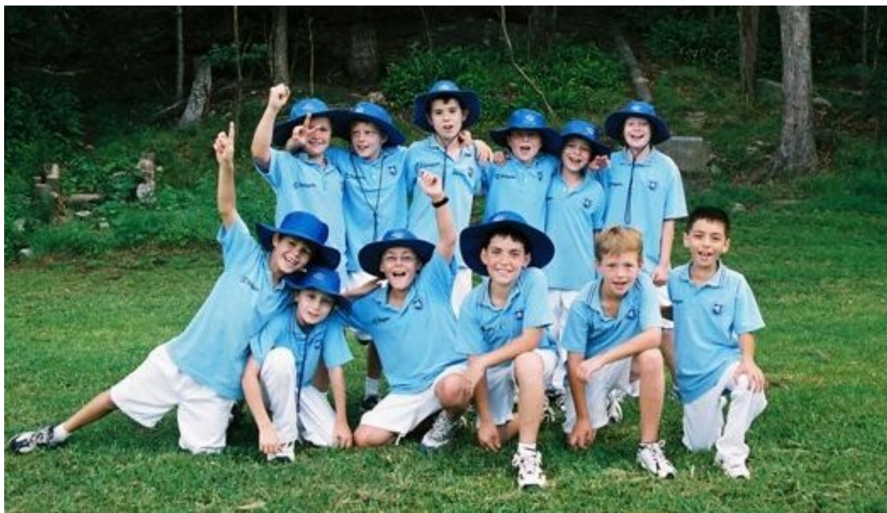
Lane Cove U9 Ponting