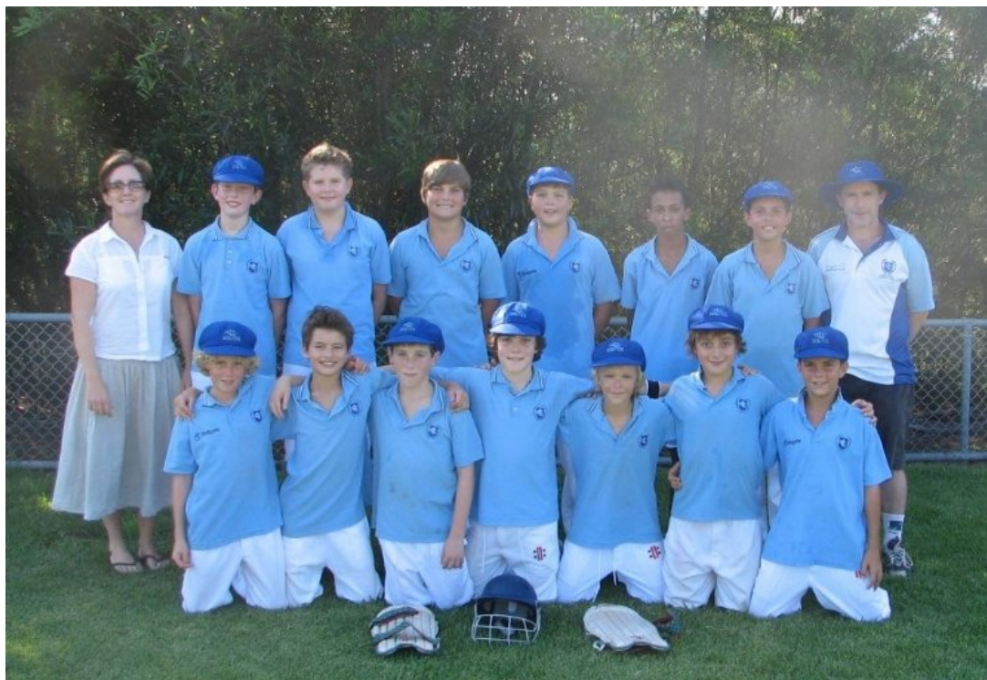
Lane Cove U13 Trumper