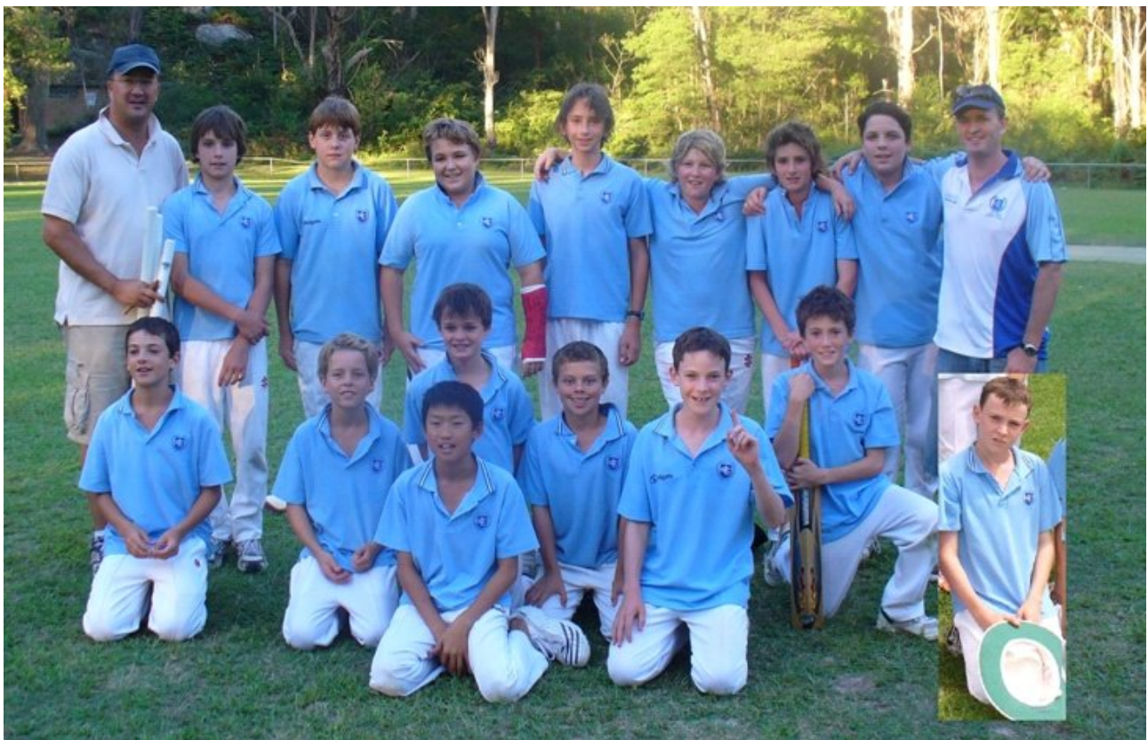
Lane Cove U13 Bradman