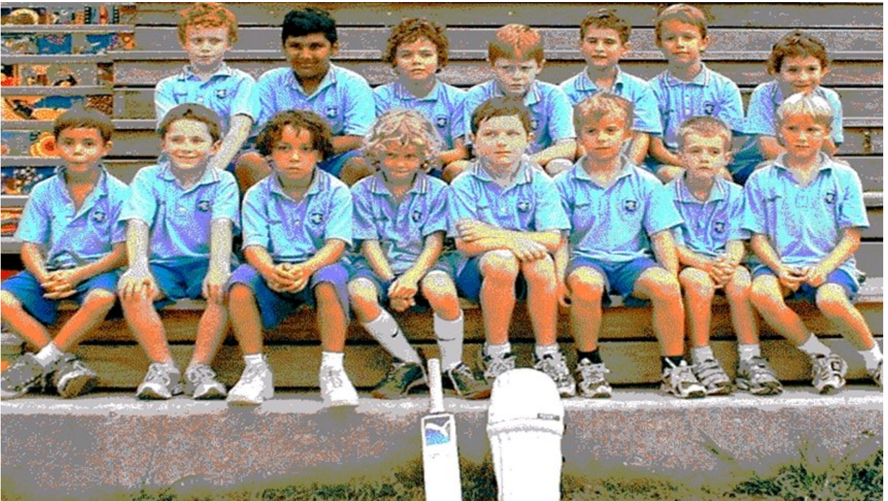
Lane Cove U9 Lee