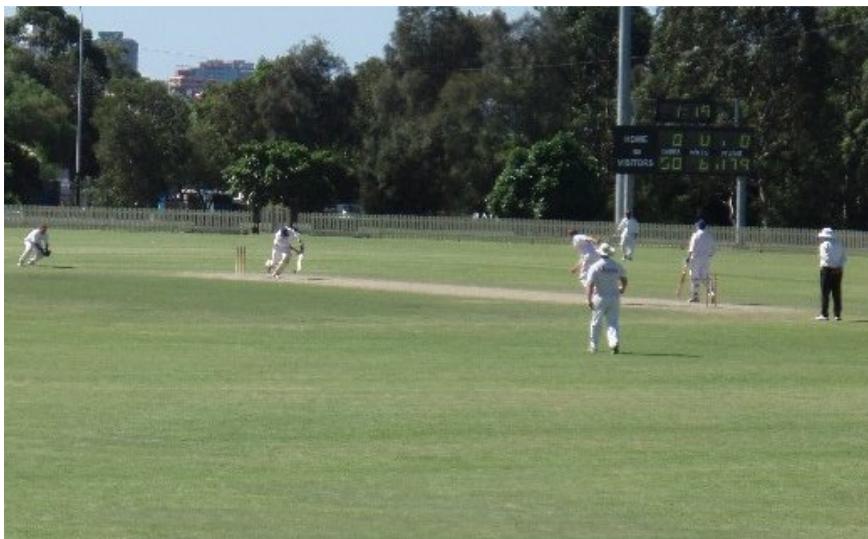
Gerard Boyle knocks one through midwicket, also during the Grand Final.