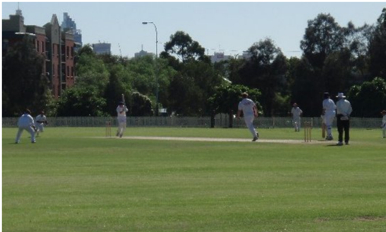
The loveliness of Paul Backhouse in full flight during the Grand Final.