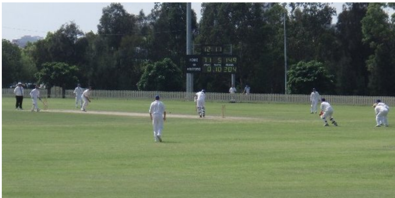
Camarsh sends one down during the Grand Final, possibly off the cheating short run.