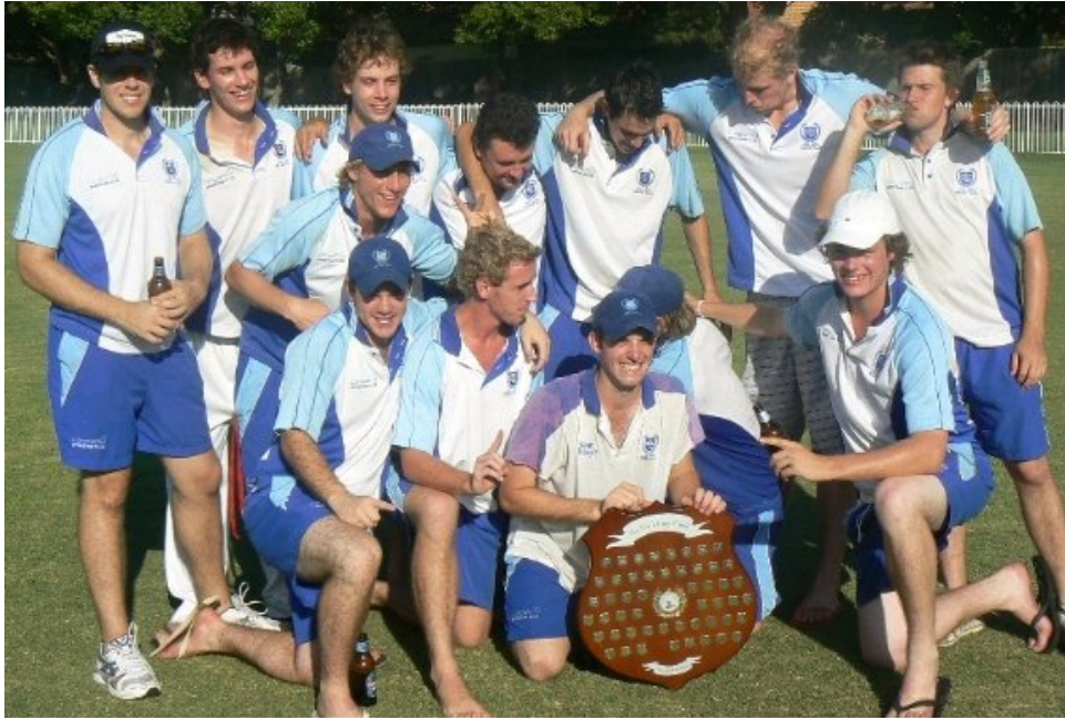
Lane Cove – 2006/07 Frank Gray Premiers