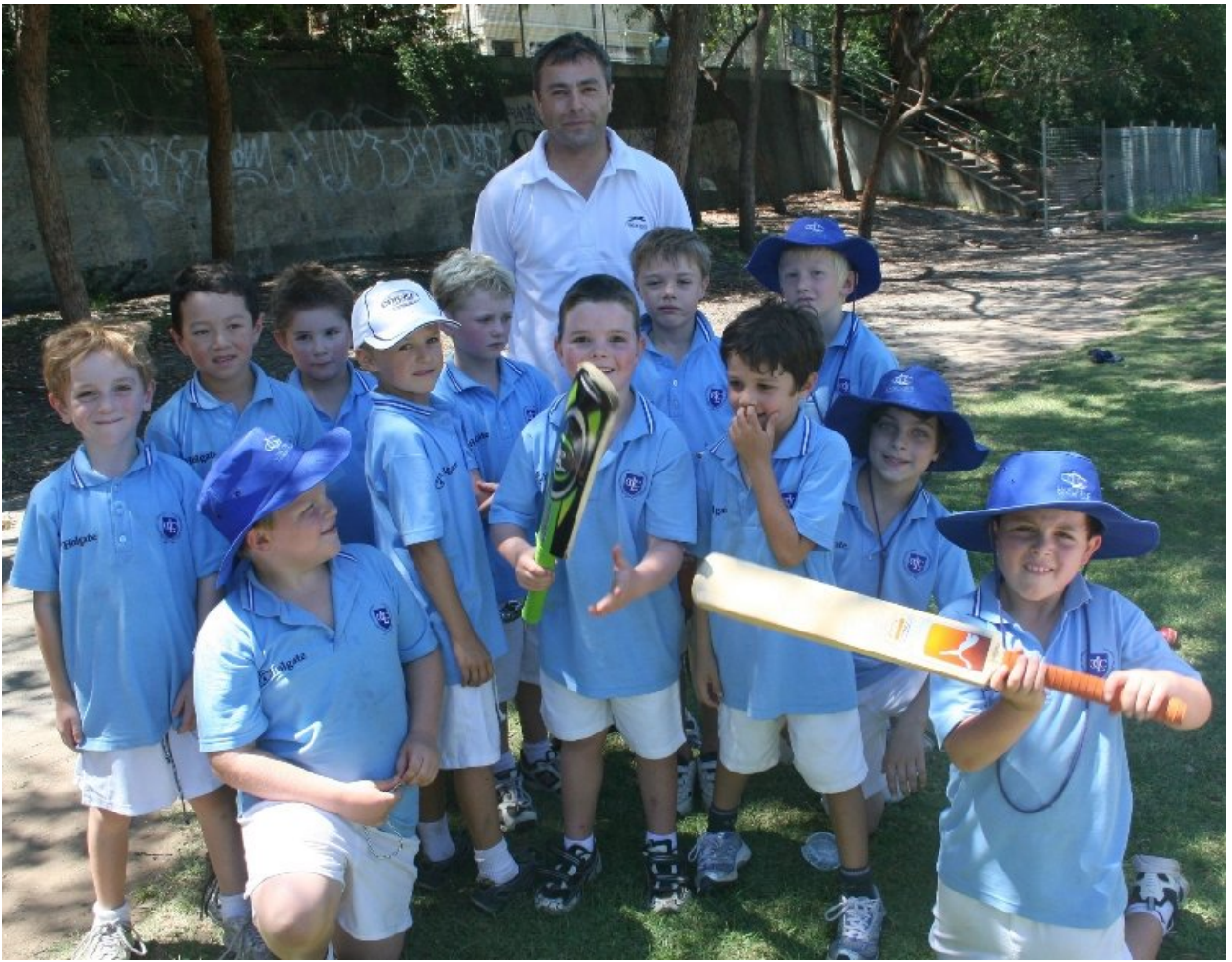
Lane Cove U9 Bradman