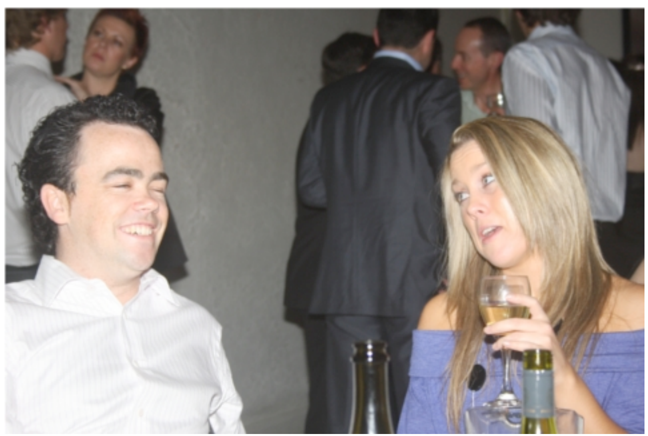
When too much sneak just isn't enough. Sorry Sneaky, you're not the right Pete.