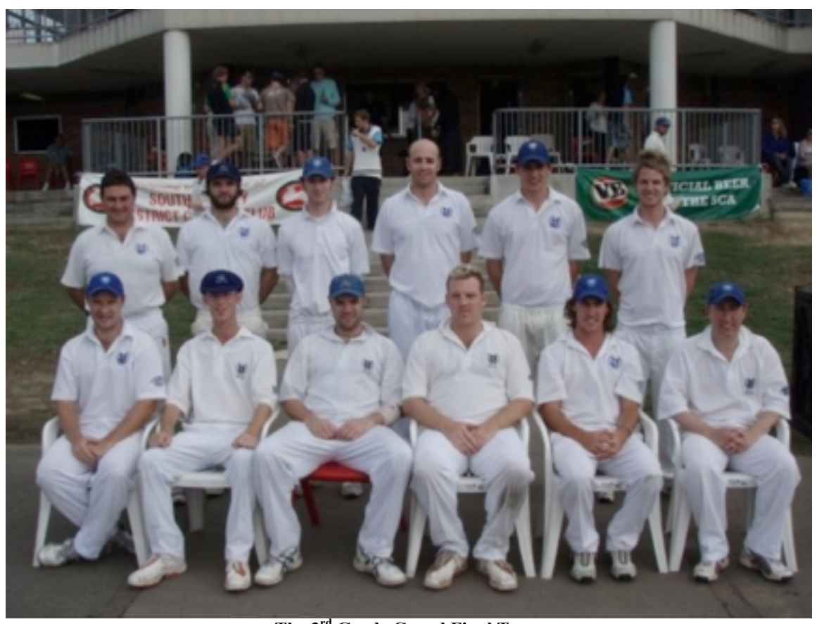
The 3<sup>rd</sup> Grade Grand Final Team