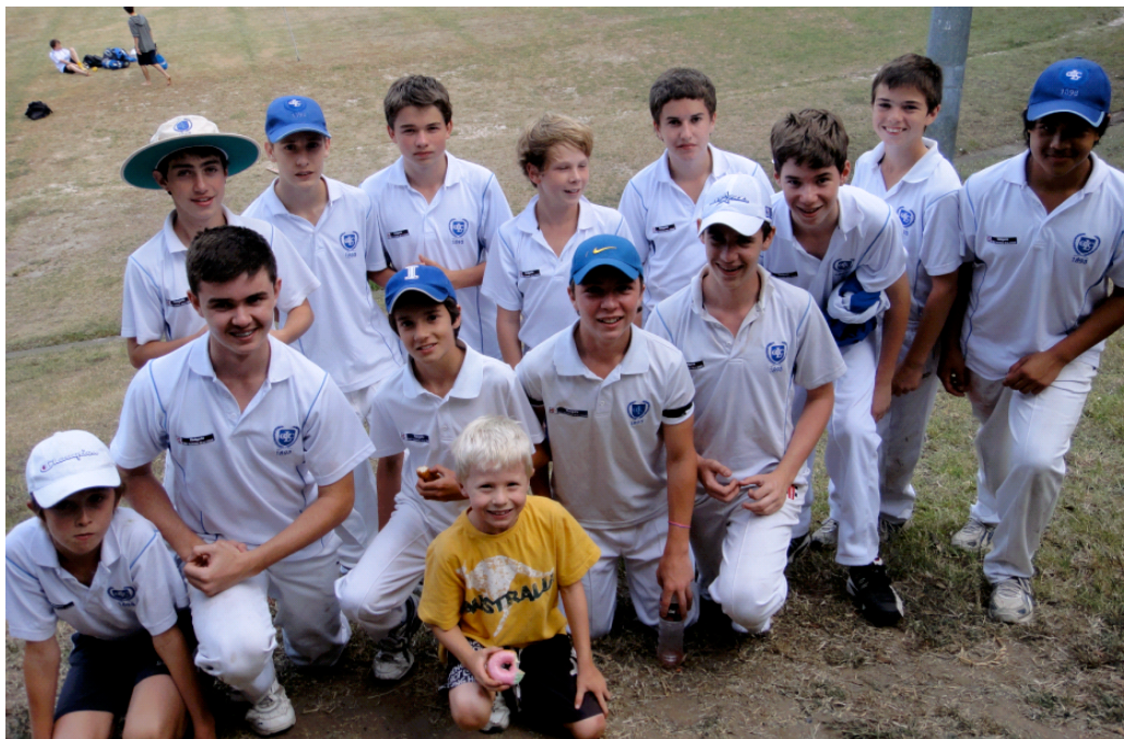
Lane Cove U14 Watson - 2010/2011

Another very good season marked by both great team and individual performances. U14 Watson ended up second on the ladder losing only 1 game during the home and away season.