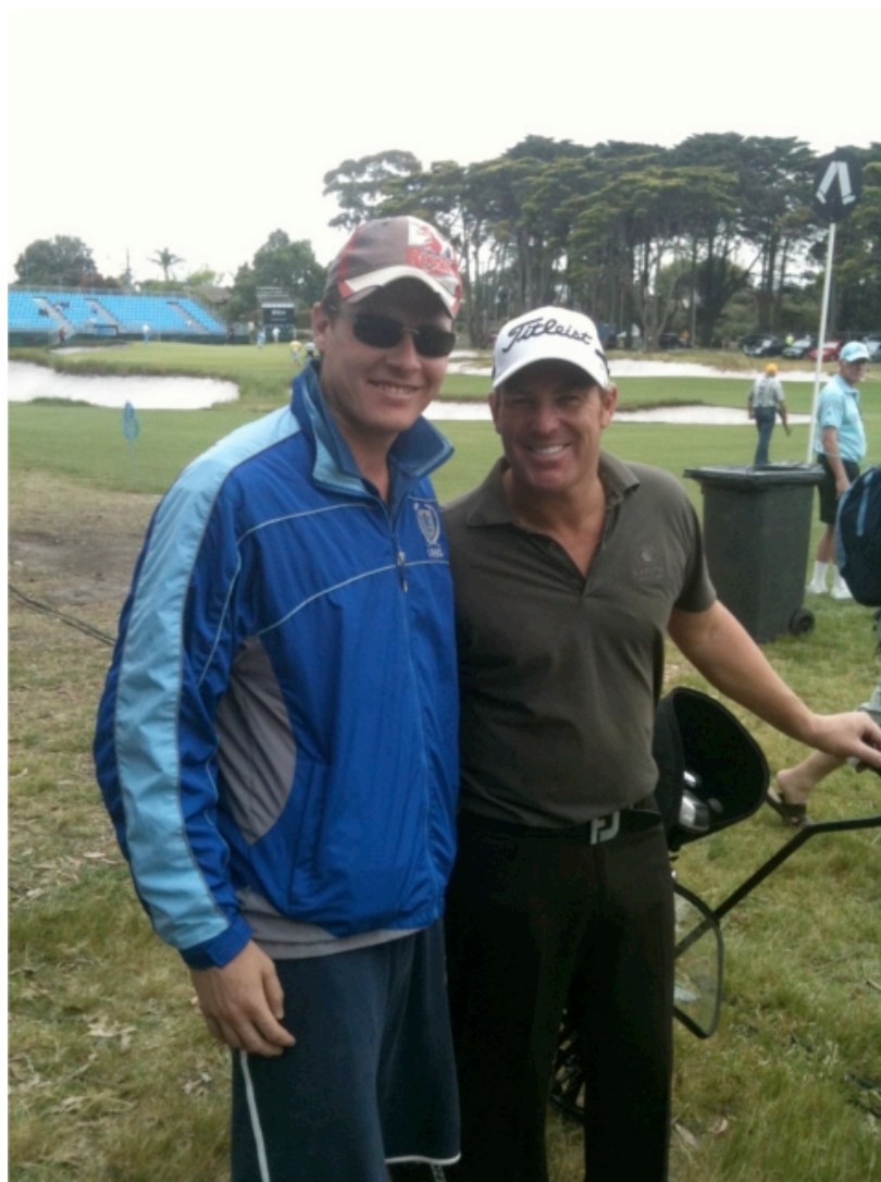
Before Liz there was Dodds